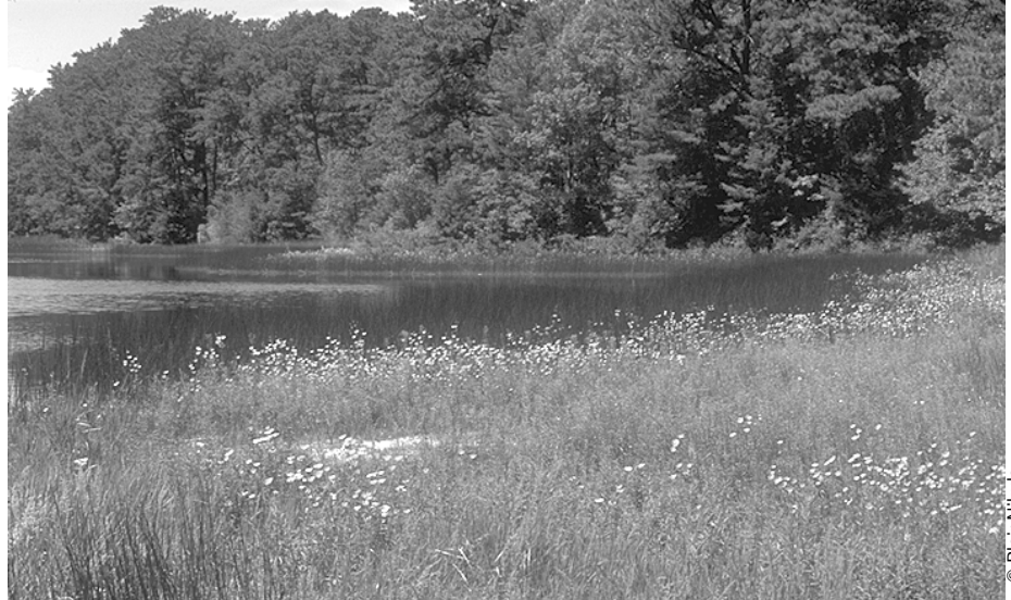
Run Pond, Dennis, with its shoreline carpet of Plymouth Gentian

Run Pond hosts a diverse array of odonates, numbering no less than 39 species. Among these are most of the typical coastal plain species of southeastern New England, including Atlantic Bluet ( Enallagma doubledayi ), Pine Barrens Bluet ( E. recurvatum ), Comet Darner ( Anax longipes ), Common Sanddragon ( Progomphus obscurus ), Martha's Pennant ( Celithemis martha ), Golden-winged Skimmer ( Libellula auripennis ), Blue Corporal ( L. deplanata ), and Carolina Saddlebags ( Tramea carolina ). Not only is the diversity impressive, but the sheer numbers of individuals can be mind-boggling, often numbering into the thousands. On a typical mid-summer day the emergent plants, predominately Military Rush ( Juncus militaris ), are festooned with spreadwings, bluets, skimmers, pondhawks and pennants, while male darners and saddlebags cruise the shoreline, and the water's surface teems with patrolling males and tandem pairs of bluets and pennants. When conditions are favorable, a profusion of coastal plain pondshore plants, most strikingly Plymouth Gentian ( Sabatia kennedyana ) and Rose Coreopsis ( Coreopsis rosea ), provide a stunning background to the bustling winged activity.