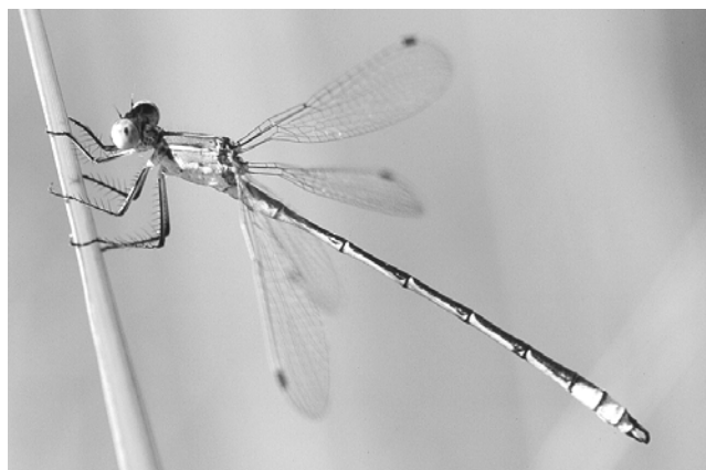
Lyre-tipped Spreadwing ( Lestes unguiculatus ) Valentine, NE — 07/99

understand the demographics of odonates. In archival boxes is the collection of odonates from the years of 1970 and 1971 by Chris Leahy of the Massachusetts Audubon Society. All the specimens are neatly placed in glycine envelopes with a card explaining the identification and location of each. They are arranged in pairs with a specimen of male and female in each envelope.