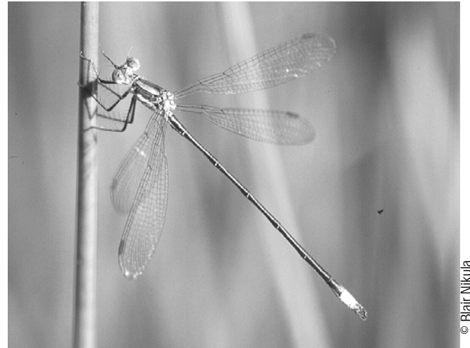
Swamp Spreadwing ( Lestes vigilax ) Dennis, MA — 07/99

individuals in 1999, with a subsequent sharp drop last year. Slaty Skimmer ( Libellula incesta ) and Blue Dasher ( Pachydiplax longipennis ) also showed some indication of increases. All three of these are very common, widespread species found in a variety of wetlands.