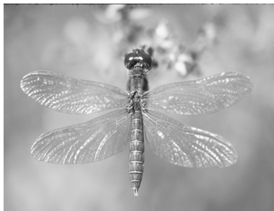
Eastern Amberwing ( Perithemis tenera ) Brewster, MA—07/01