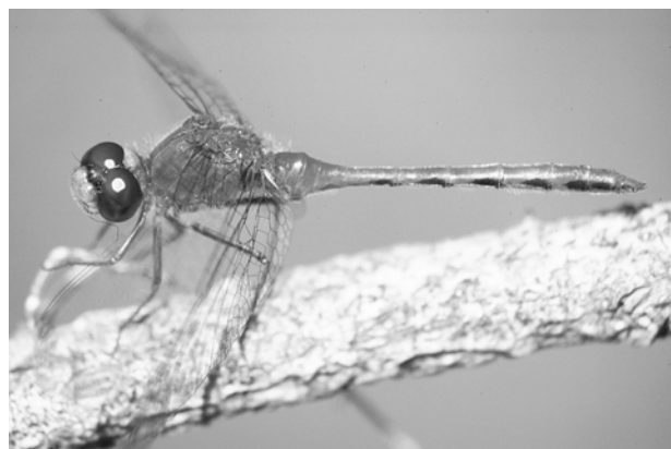
Ruby Meadowhawk ( Sympetrum rubicundulum ) Barnstable, MA — 08/00

The three “old” forms are the Ruby Meadowhawk ( Sympetrum rubicundulum ), Cherry-faced Meadowhawk ( S. internum ), and White-faced Meadowhawk ( S. obtrusum ). Both Cherry-faced and White-faced meadowhawks are northern species with similar distributions that extend across Canada and the northern states, from coast to coast. The Ruby