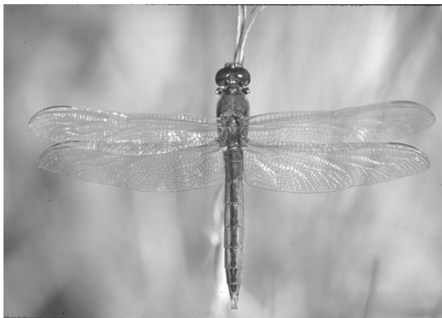
Golden-winged Skimmer ( Libellula auripennis ) Dennis, MA — 07/96

The most striking decline was exhibited by Swamp Spreadwing ( Lestes vigilax ), which numbered into the thousands in two visits in 1996, but was absent in 1999 and nearly so in 2000. Spreadwings in general have been very scarce at many Cape Cod wetlands over the past couple of years. Martha's Pennant also dropped to near absence at Run Pond in 1999, down from hundreds in each of the previous three years. Atlantic Bluet, Common Green Darner ( Anax junius ), Comet Darner, Common Sanddragon, Calico Pennant ( Celithemis elisa ), and Golden-winged Skimmer all showed evidence of decline as well, though the results are less striking. The most amazing increase was exhibited by the Eastern Amberwing ( Perithemis tenera ), which went from absent in 1996 and 1997 to an estimated 350