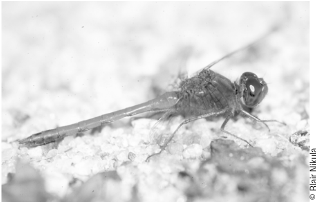
Yellow-legged Meadowhawk ( Sympetrum vicinum )— male. Legs are brown, top of face red, very little black on abdomen. Provincetown, MA — 10/00